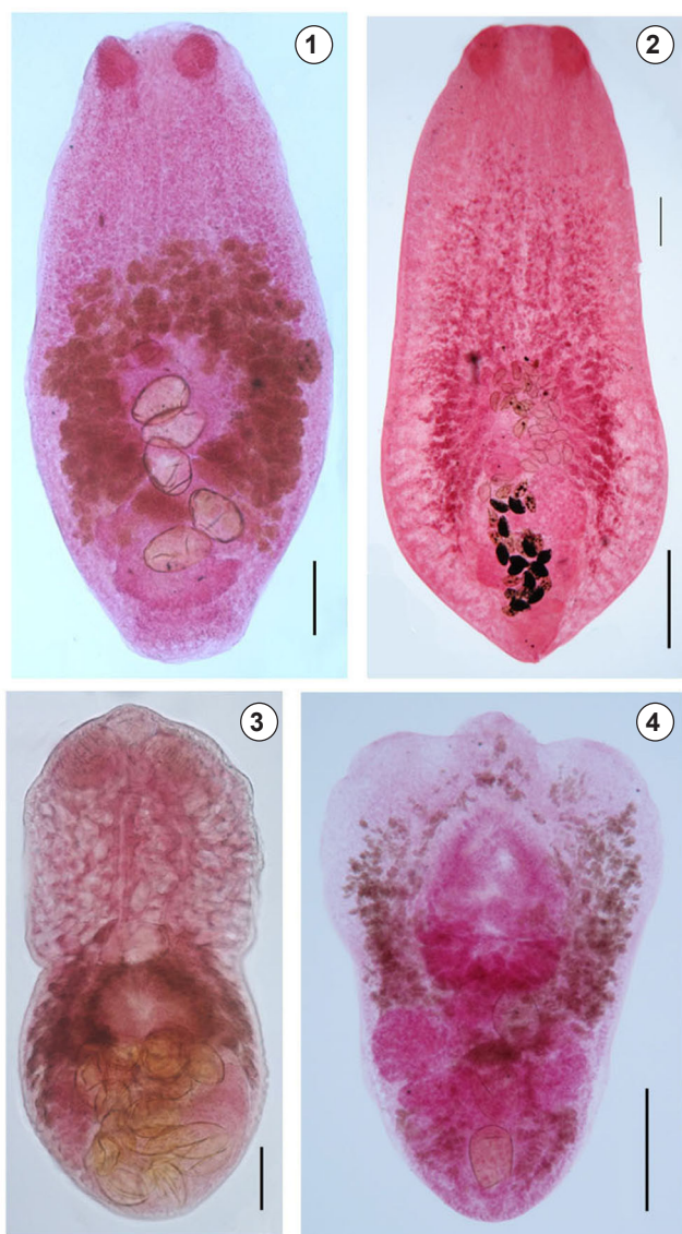
FIGURES 1-4. Digeneans from P. brasiliensis . 1. Austrodiplostomum mordax . Bar = 100 µm. 2. Austrodiplostomum ostrowskiae . Bar = 400 µm. 3. Tylodelphys adulta . Bar = 100 µm. 4. Hysteromorpha triloba . Bar = 200 µm.

This species was previously reported by Ostrowski de