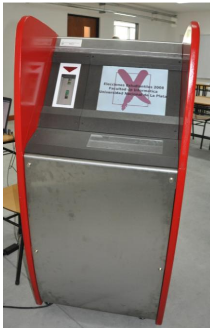
Fig. 1. Electronic ballot box used in 2007- 2008

Based on the set of conditions mentioned above, a voting structure that has, for each election precinct, a computing equipment (for precinct board members) connected to a voting machine was developed. One of these machines is shown in Fig. 1. Precinct board members are in charge of identifying voters (through the presentation of an identity card with a picture or student picture ID) from the electronic electoral register stored in the equipment. This identification allows transmitting the corresponding authorization to vote to the voting machine. After the vote is cast, the voting machine transmits a signal to the machine used by the precinct board members so that they can continue with the process. Each voting machine has an LCD touch screen, a CPU, a UPS, a thermal printer, a storage ballot box for printed votes, a device that allows viewing the vote and that automatically drops votes into the ballot box, and 2 flash memories where vote counts will be stored. The equipment used for this election does not have an Internet connection.