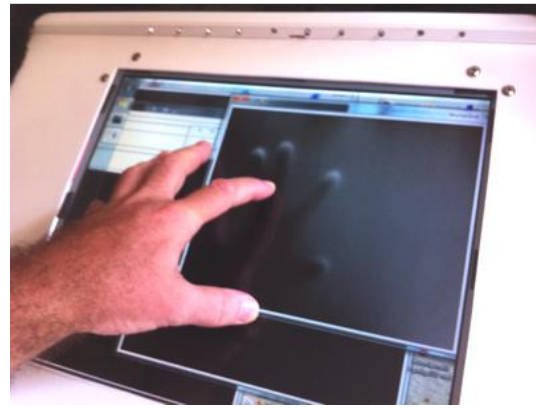
Figure 3. LCD panel mounted in a tabletop

The user interaction is captured by an infrared camera in the same way projected systems do. FTIR and DI can also be used but there are some considerations to take into account. Projected systems use a projection screen that has the beneficial collateral effect of diffusing the background images and thus making the detection of interaction easier as there are much less visible objects to segment.