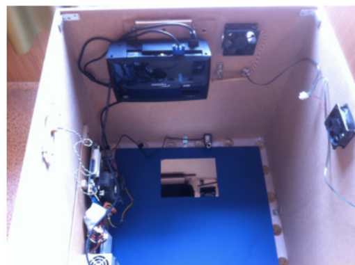
Figure 1. Projector based table

The transparent acrylic layer used as screen is a drawback for image projection, as the projected image passes through the screen. So, to solve this problem we have to add some kind of translucent projection screen. We can use a sheet of vellum, which is a kind of translucent tracing paper. An additional effect of this sheet, apart from serving as a projection screen, is the attenuation of the image seen by the cameras, the farthest objects are faded and only the nearest are seen. This makes the screen touching-objects much clearer than the background, so it makes easier the discrimination of what is a touch interaction and what belongs to background and decreases the importance of illumination variations.